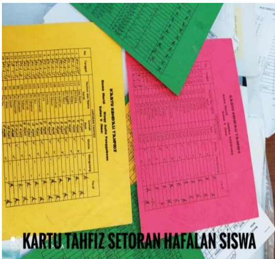
Figure 10. Student's Recitation Card