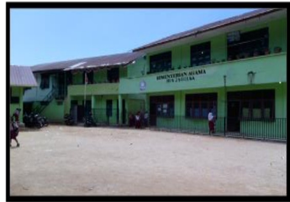
Figure 2. Field of MIN 2 Sibolga