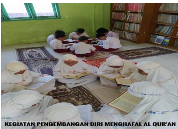
Figure 13. Self-development Activity

Self-development is a given discretion to the students to improve their potential. It is supported by spirit and activity facilities given by MIN 2 Sibolga. The self-development refers to learn PAI (Islamic teachings) material deeply, including reading, writing, memorizing Qur’anic verse and hadith, and practicing ablution procedures, salat (prayer), zikir , and praying.