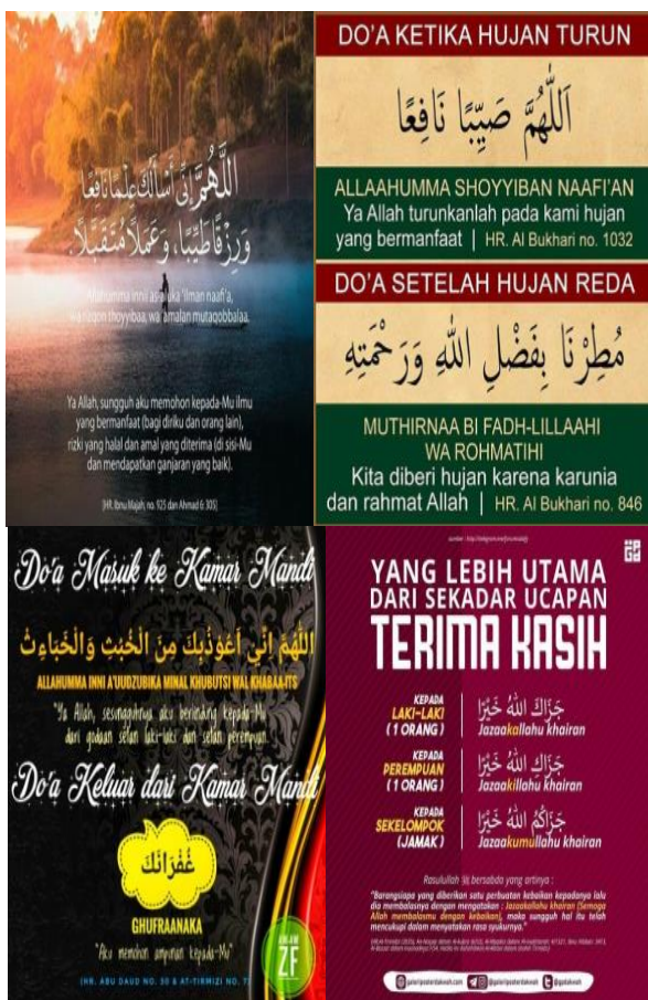
Figure 9. Some Examples of Posters Displayed in the Classroom.

Based on the picture, commonly the students will be attracted to see the posters. It is because the posters are displayed on an ideal spot for young learner vision. Further, the posters displayed by the school personnel are as follows.