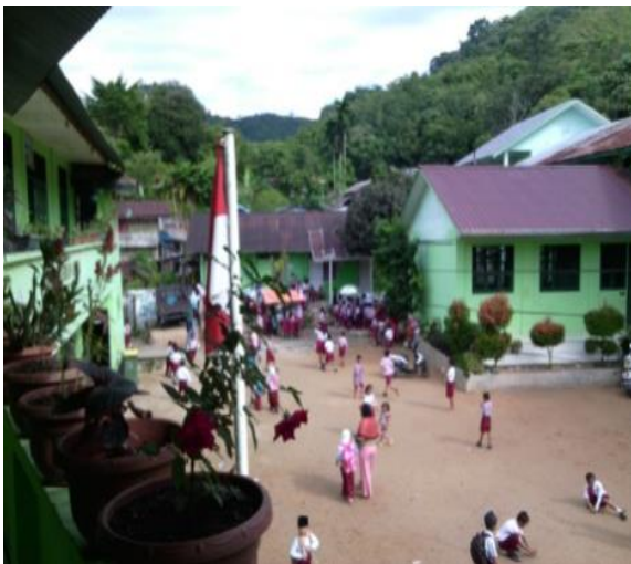
Figure 14. Flower and Infrastructure Management in MIN 2 Sibolga

Managing school infrastructure is done by (1) organizing a classroom where the lower grade is on the first floor, and the higher grade is on the second floor.