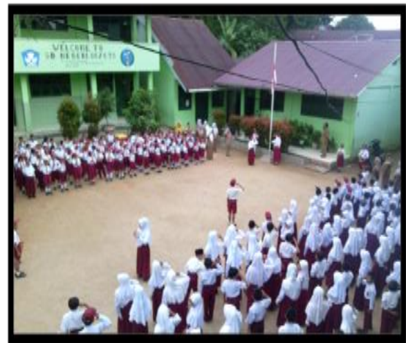
Figure 3. Field of SDN No. 087659

Its location which is directly placed in front of SDN 087659 gives chance as well as a challenge for the school personnel. One of the challenges is that MIN 2 Sibolga does not have its own field since it was built 31 years ago, so it has to use SDN 087659 field. Also, the close position of the schools makes MIN 2 Sibolga must be competitive in the interacting public interest and adjusts public needs through recommended activities and school routine. Here is the documentation of MIN 2 Sibolga and SDN 087659 position.