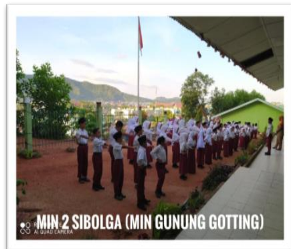
Figure 4. The 2 nd Building MIN 2 Sibolga

In the current development, MIN 2 Sibolga has two buildings located in two different districts. The first building is known as “MIN Kaje-Kaje” or its old official name as “MIN Aek Hambil”, located on Jl. SM. Raja Gg. Gotting Kelurahan Aek Parombunan.