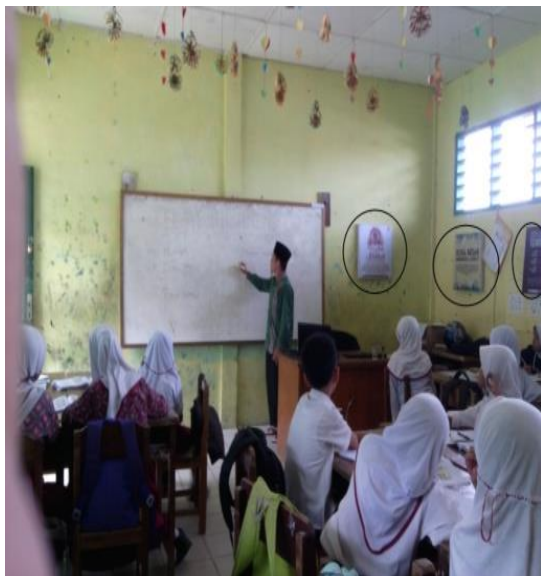
Figure 8. Poster containing hadith, religious advices, and prayers displayed on the wall.

Based on the picture, commonly the students will be attracted to see the posters. It is because the posters are displayed on an ideal spot for young learner vision. Further, the posters displayed by the school personnel are as follows.