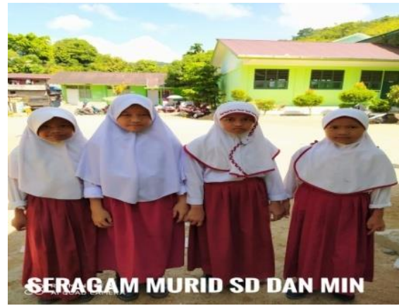
Figure 7. MIN 2 Sibolga and SDN 087659 Student Uniforms

Uniform is an important thing to show school identity. The MIN 2 Sibolga uniform is following the color and model regulated by the government. Further, there is a unique in MIN 2 Sibolga students' uniform in which according to Sibolga Education Authorities instruction, the male wears trousers, and the female wears a long skirt and craft.