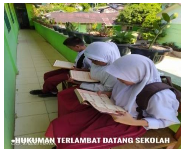
Figure 6. Punishment to the Students who Come Late

Late and punishment is an affirmation inflicted by the school personnel on the students. It is begun by socializing it to the students as a disciplined exercise. So, before coming late, the students knew the consequences.