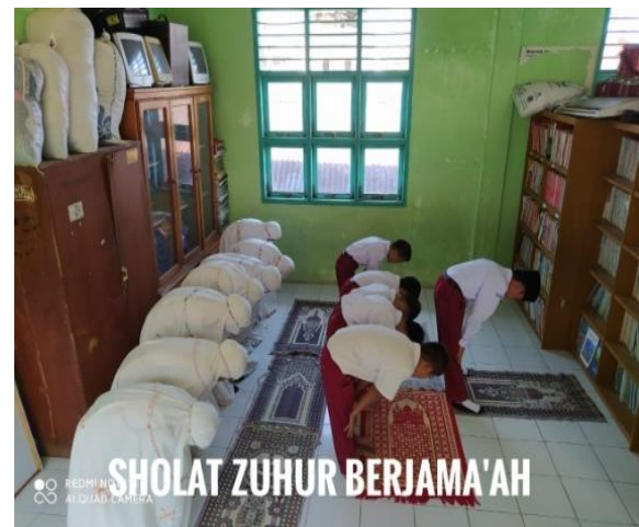
Figure 11. Pray Together in MIN2Sibolga

These habituations are to guide the students to say good things, and indirectly to pray for one another so as to get the blessing and "conducive" climate in the school. Further, pray together activity is done two times, Dhuha prayer and Zuhur prayer.