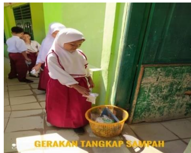
Figure 5. Collecting Rubbish Activity (CRA)

Collecting rubbish activity is a cleanlife culture and loving environment practiced daily by the students in MIN 2 Sibolga.